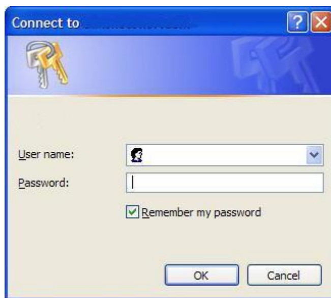
Figure 2 – BASIC pop-up window

Figure 2 displays a typical browser pop-up window asking for BASIC authentication details.